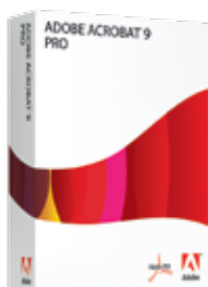
Adobe Acrobat 9 Pro