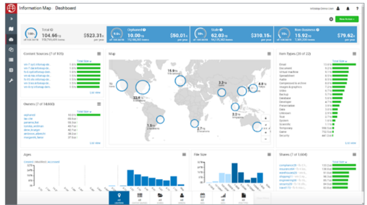
Figure 2. Veritas Information Map integration renders your information environment in visual context and guides users towards unbiased, information-governance decision making.

Backup Exec's integration with Veritas™ Information Map renders your information environment in visual context and guides users towards unbiased, information-governance decision making. Using the Information Map's dynamic navigation, customers can identify areas of risk, areas of value and areas of waste across their storage environment and make decisions which help reduce information risk and optimize information storage.