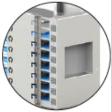
OPTION TO STACK OR HANG ON WALL