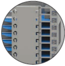
EASY CABLE MANAGEMENT