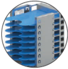
COMES FULLY ASSEMBLED